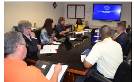
Focus group members discuss the project.

ments users are allowed to file at one time in the E-File System and adding a watermark along the margin of E-Filed documents, to name a few. Phase I is to be completed by June 30, 2017.