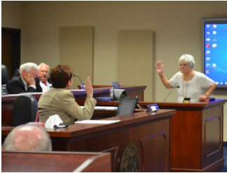
A public witness is sworn in during the SCE&G Night Hearing held in Columbia, SC in Docket No. 2012-203-E.

The Public Service Commission has overseen many rate cases in 2012. Several of these cases have called for public night hearings to be held at various locations around the state. A night hearing is typically held at the request of an Applicant or a third party. Featured here are some pictures from our most recent night hearings: