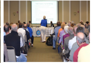
A public witness presents a PowerPoint presentation during her testimony in Docket No. 2012-177-WS in Tega Cay, SC.