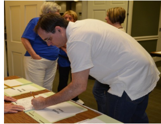
A public witness signs in before the Tega Cay Water Service, Inc. Night Hearing held in Tega Cay, SC in Docket No. 2012-177-WS.