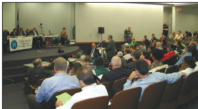
Duke Energy Carolinas, LLC Night Hearing at Spartanburg Community College