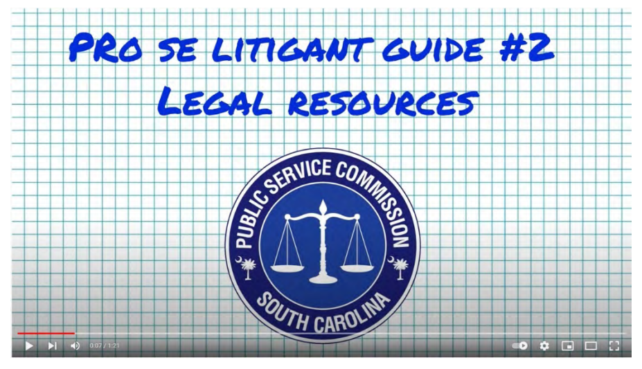
Click the image above to view the video.