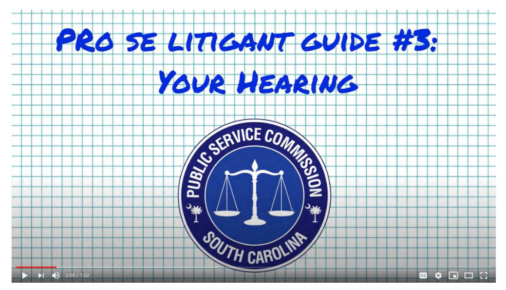
Click the image above to view the video.