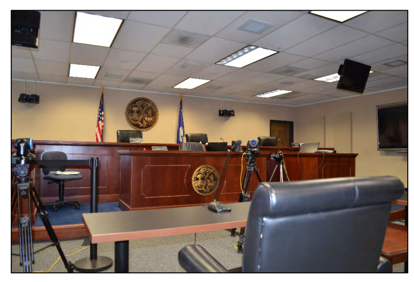
View of Commissioner bench from Applicant's Seat.

At this point, the Chairman will ask whether there are any preliminary matters to come before the Commission. These could be in the form of outstanding procedural motions, the presentation of any Settlement Agreements that might have been reached, the presentation of an opening statement, or other matters. Once these are disposed of, the Commission will be ready to hear testimony. Your testimony will be recorded by the Commission's court reporter and may be livestreamed.