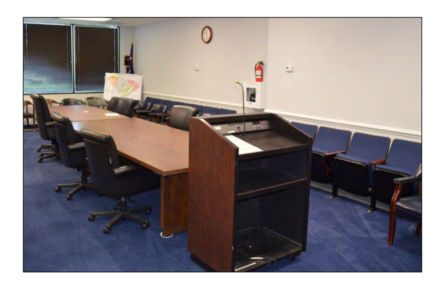
Commission's Meeting Room

At the appointed time of the hearing, the Hearing Examiner will call the hearing to order and read the docket information. The Hearing Examiner will then ask the parties before the Commission to identify themselves, through their lawyers, if applicable. As a pro se litigant, you will be asked to identify yourself for the record of the case. At this point, the Hearing Examiner will generally ask whether there are any preliminary matters to come before the Commission. These could be in the form of outstanding procedural motions, the presentation of any Settlement Agreements that might have been reached, the presentation of an opening statement, or other matters.