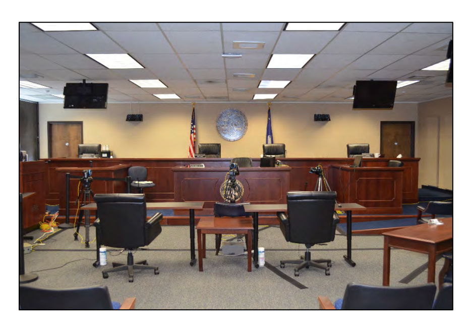
Commission's Hearing Room

The hearing will be held in either the Commission's Hearing Room, the Commission's Meeting Room (see the following page) or virtually. Please arrive early in order to become familiar with your surroundings. If you need assistance, go to the front desk of the Commission's offices.